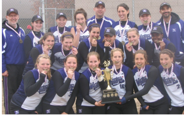
'10 League & Ontario Champions (24Wins, 0 losses)