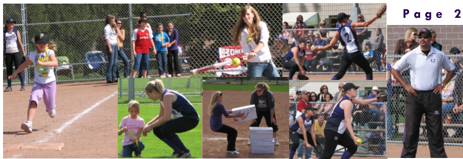
Running the bases, meeting the Mustangs, box races, longest hit contest, and cheering on the Mustangs vs Guelph on Mustang — CSL Day (Sept 19, 2010).

Recent/Upcoming Program Activities: Community Softball League Day: The Mustangs hosted Guelph, Sept 19 on 'Stang-Community Softball League Day. Area youth softball players participated in pre-game introductions and between game activities (running the bases, box races, longest hit contest, etc).